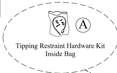
Tipping Restraint Hardware Kit Inside Bag